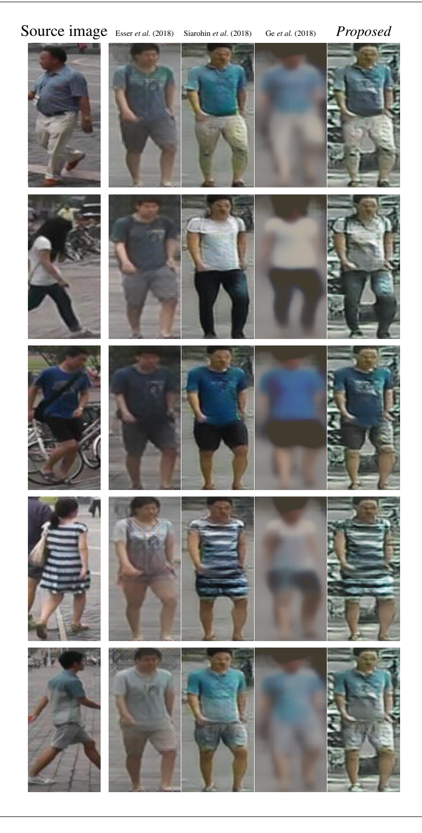
Figure 3: Qualitative results on the Market-1501 dataset. Columns 1 represents the source image. The last four columns show the output of different methods and ours