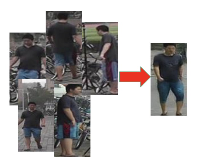
Figure 1: The motivation of the proposed method. Given an image in an arbitrary pose, we will be able to synthesize that person in front view